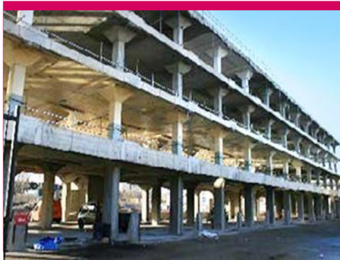
Bottle Store Stockwell, SW9 Client: City & Provincial Plc

Employment land study on behalf of IPSUS.