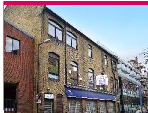
Rushworth Street London, SE1 Client: Mazeford Developments

Commercial viability study on behalf of ART Estates.