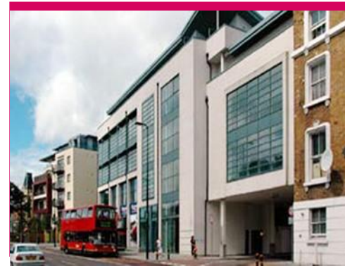
Former Savoy Laundry Site Clapham, SW9 Client: Private Property Company

Employment land study on behalf of Grainger Plc.