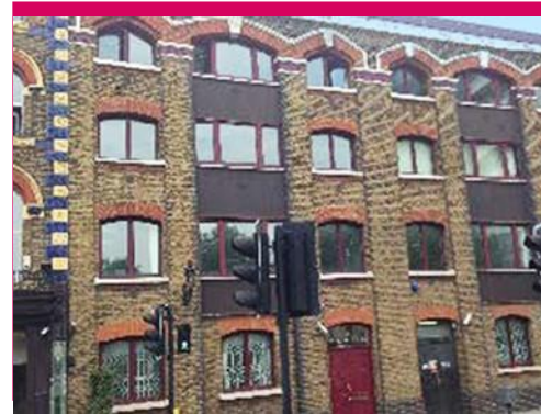
Albert Embankment Vauxhall, SW8 Client: OCUBIS Ltd.

Employment land study on behalf of City & Provincial.