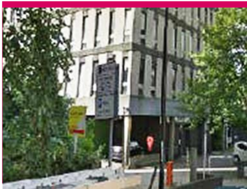
Tileman House Putney, SW15 Client: Laing Homes Plc

Expert planning witness at planning inquiry on behalf of a private property company.