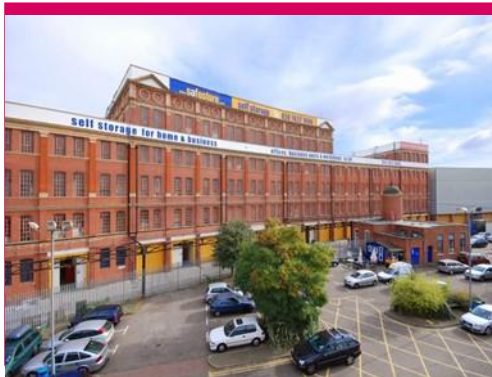
Ingate Place Battersea, SW8 Client: Safestore

Commercial viability report for the above proposed scheme.