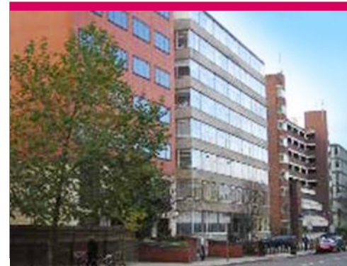
113, Upper Richmond Road Putney, SW15 Client: IPSUS Ltd.

Employment land study on behalf of Laing Homes.