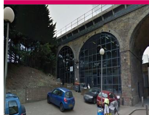
Gresham Road Brixton, SW9 Client: Taylor Wimpey South East

Commercial accommodation report on the above proposed scheme.