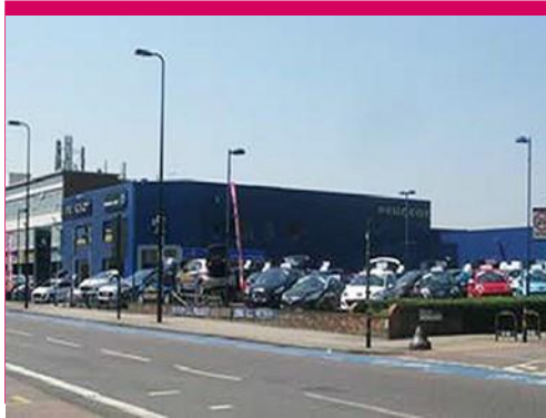
Former Peugeot garage Clapham Road, SW9 Client: Mazeford Developments Ltd.

Commercial viability report for Mazeford developments limited.