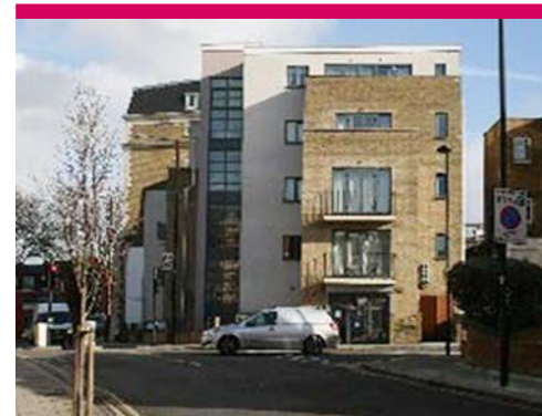
Elms Crescent Clapham, SW4 Client: Laing Homes Plc

Expert planning witness at planning inquiry on behalf of Laing Homes.