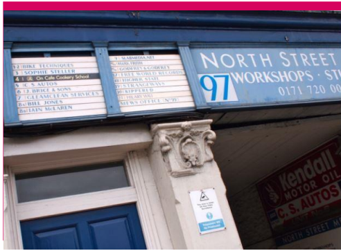
North Street Mews Battersea, SW4 Client: Highlaw Ltd

Commercial accommodation report on the above proposed scheme.