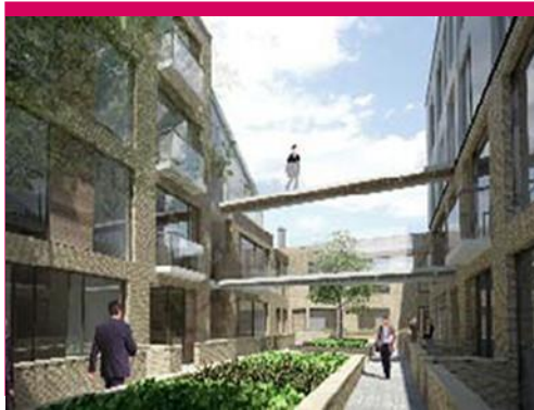
Macaulay Walk Clapham Old Town, SW4 Client: Grainger Plc

Employment land study on behalf of Grainger Plc.