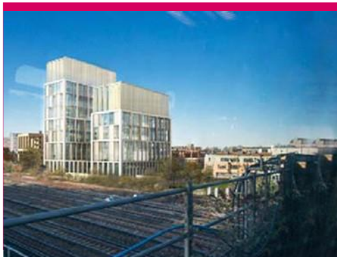
Patcham Terrace Battersea, SW11 Client: Taylor Wimpey Central London

Employment land study on behalf of IPSUS.