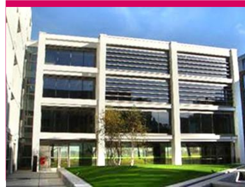
Wingate Square Clapham, SW4 Client: IPSUS Ltd.

Commercial viability report for Mazeford developments limited.