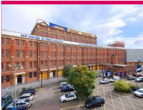
Ingate Place Battersea, SW8 Client: Safestore

Commercial viability report for the above proposed scheme.