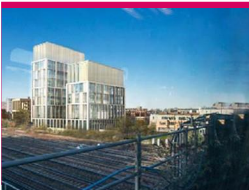
Patcham Terrace Battersea, SW11 Client: Taylor Wimpey Central London

Employment land study on behalf of IPSUS.