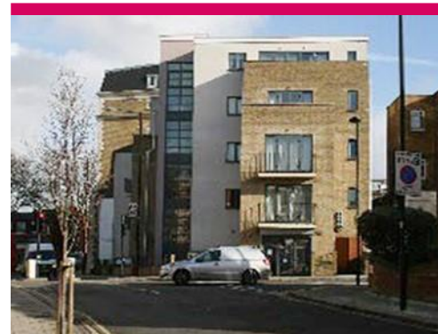
Elms Crescent Clapham, SW4 Client: Laing Homes Plc

Expert planning witness at planning inquiry on behalf of Laing Homes.