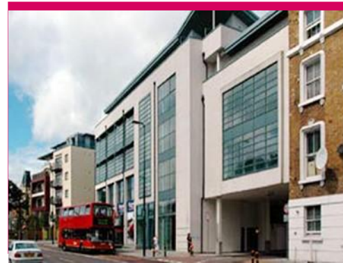
Former Savoy Laundry Site Clapham, SW9 Client: Private Property Company

Employment land study on behalf of Grainger Plc.