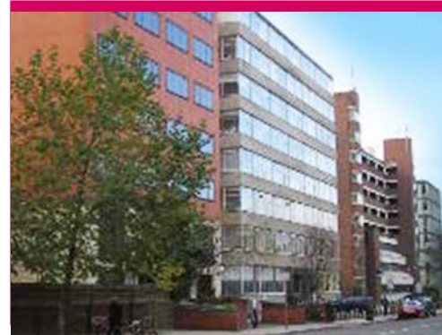
113, Upper Richmond Road Putney, SW15 Client: IPSUS Ltd.

Employment land study on behalf of Laing Homes.