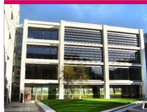
Wingate Square Clapham, SW4 Client: IPSUS Ltd.

Commercial viability report for Mazeford developments limited.