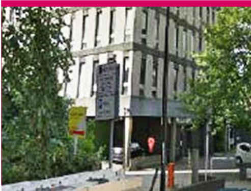
Tileman House Putney, SW15 Client: Laing Homes Plc

Expert planning witness at planning inquiry on behalf of a private property company.