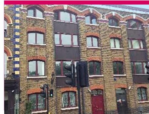
Albert Embankment Vauxhall, SW8 Client: OCUBIS Ltd.

Employment land study on behalf of City & Provincial.