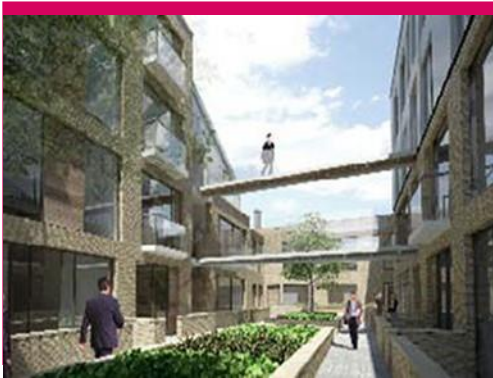
Macaulay Walk Clapham Old Town, SW4 Client: Grainger Plc

Employment land study on behalf of Grainger Plc.