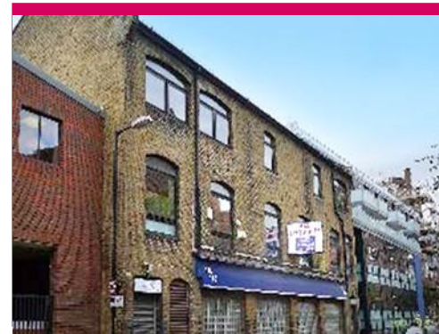
Rushworth Street London, SE1 Client: Mazeford Developments

Commercial viability study on behalf of ART Estates.